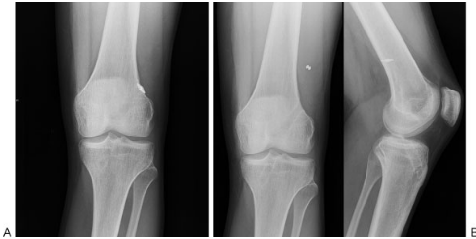
Fig. 1 Standard anteroposterior and lateral knee radiographs of the involved knee. (A) Immediate postoperative radiographs showed proper placement of the XoButton as well as the femoral and tibial tunnels. (B) Six months after the operation, the implant was seen 39 mm more proximally than in (A).

examination no instability was observed. Radiographic examination revealed that the implant had migrated 39 mm proximally in comparison to the immediate postoperative radiograph (►Fig. 1A, B). Magnetic resonance evaluation showed a 79 × 60 × 17 mm multilobulated tumor extending from the eroded exit of the femoral tunnel. The implant device was observed in its posteriormost area (►Fig. 2). The ACL graft was seen correctly positioned and it appeared to be in good condition. No alteration of the erythrocyte sedimentation rate (ESR) and C-reactive protein (CRP) level were observed.